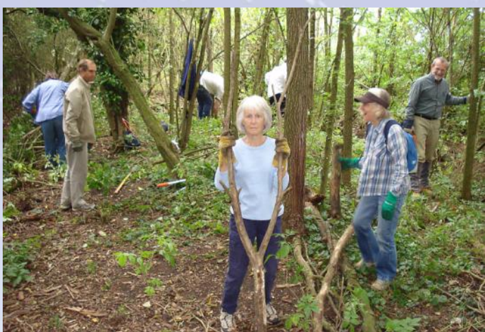
<u>Tasks</u>, <u>Activities and Friends Meetings</u> www.putnoemowsburyfriends.org.uk Mobile site: www.pwmhfriends.com

With the amount of maintenance and clearance tasks over the year the pressure started to show on some of us. Never fear, our dead hedging elite are good for a few more years yet.